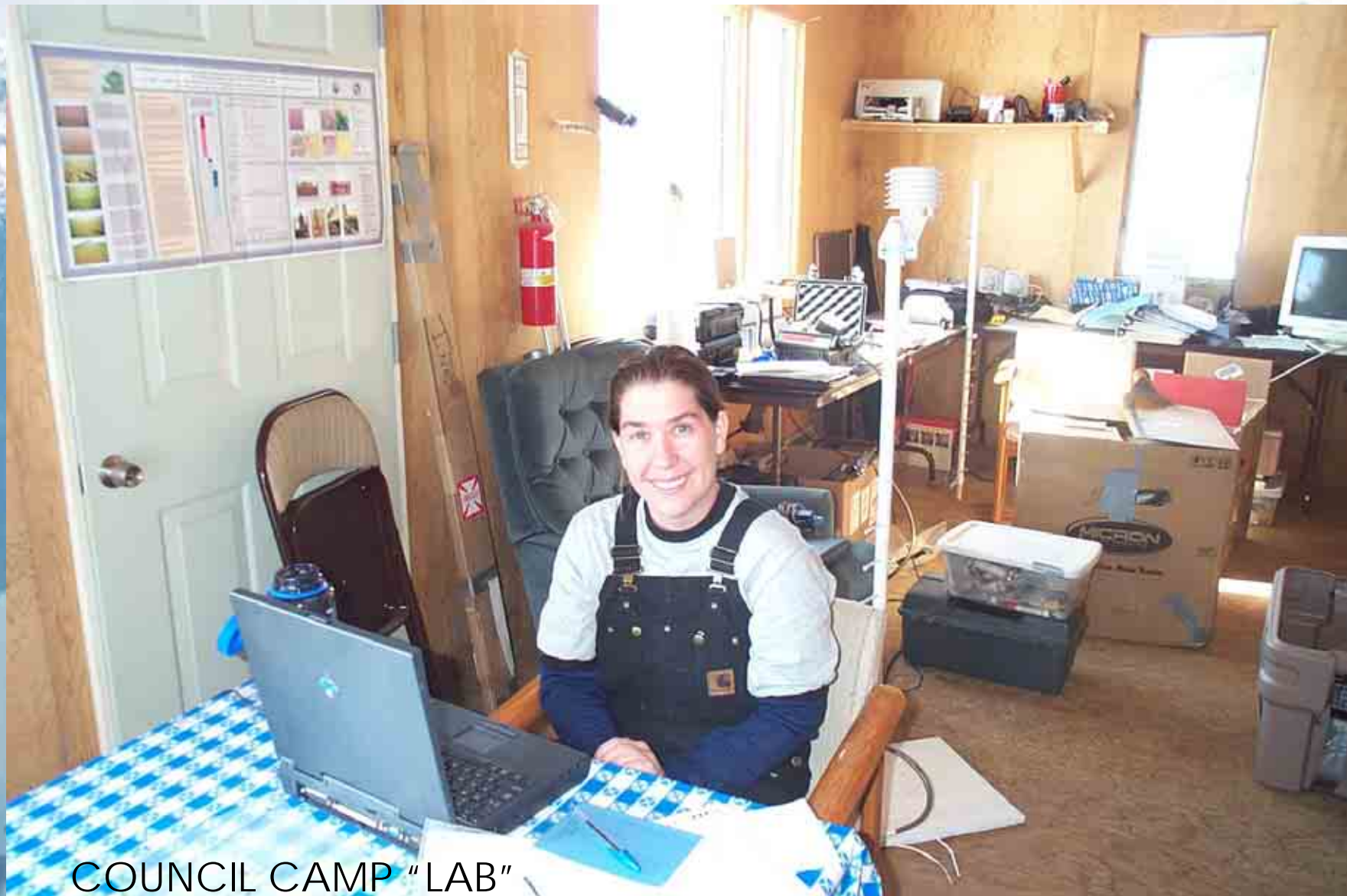
COUNCIL CAMP "LAB"