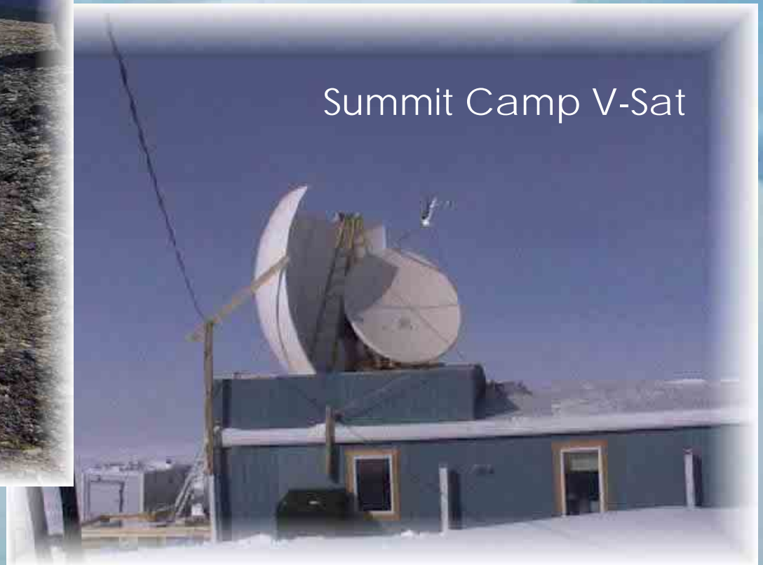
Summit Camp V-Sat