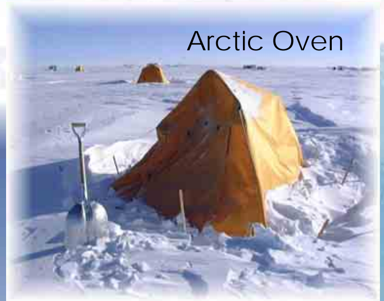
Summit Camp Big House